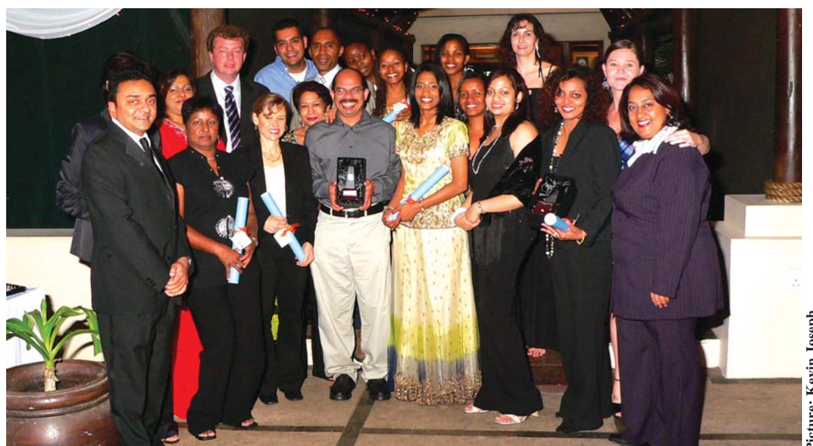
UKZN’s Corporate Relations staff members at the UNITECH Awards Banquet.