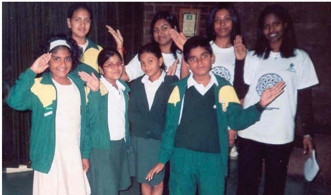
UKZN Speech-Language Pathology students, wearing their AAC awareness T-shirts with some of the learners from Pitlochry school.

AAC is just what the name says: Augmenting communication where a person’s existing communication is not functional for the communication demands placed on them; or an alternative means of communication where children or adults have developmental or